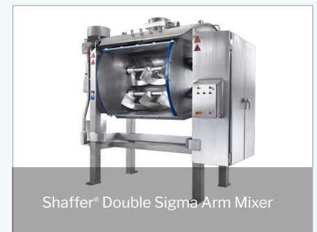
Shaffer® Double Sigma Arm Mixer

Shaffer offers the most extensive and innovative line of horizontal mixers in the baking industry. Mixers are available with triple roller bar, single sigma, double sigma or high shear agitators and are custom designed with an enclosed frame, open frame, and open frame hybrid designs. Shaffer engineers every mixer to meet exact product and facility needs to help our customers save money and increase quality.