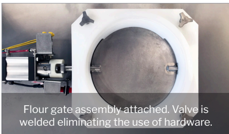
Flour gate assembly attached. Valve is welded eliminating the use of hardware.

The flour gate assembly is compatible with both standard and BFM flour socks. The assembly can even be retrofit to existing mixers with some minor adjustments to the existing canopy.