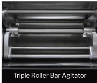
Triple Roller Bar Agitator

Shaffer ® Eagle Series Mixers are ideal for a variety of dough or specialty products with batch capacities from 200 to 800 pounds. Eagle Series Mixers offer a simple economical solution for small batch operations in a constant mixing and processing production environment or smaller manual bakery operation.