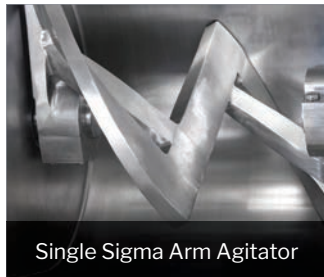
Single Sigma Arm Agitator

Ideal for mixing breads, buns, rolls, pizza dough, and flour tortillas.