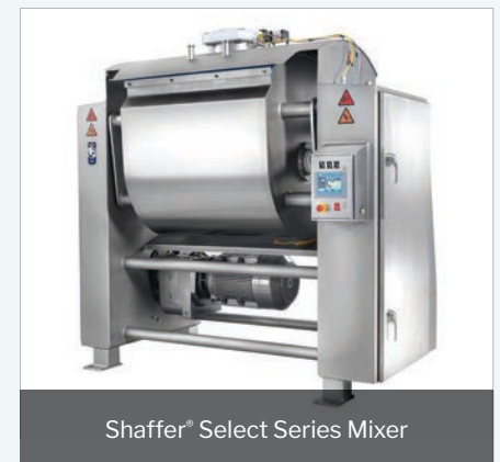
Shaffer ® Select Series Mixer

Shaffer ® Select Series Mixers are precisely engineered to offer maximum value and durability. They are suitable for small industrial bakeries with capacities from 600 to 1,600 pounds depending on the product. Select Series Mixers are available with a triple roller bar or single sigma arm agitator.