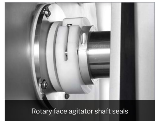
Rotary face agitator shaft seals

For additional information or to request a quote, call +1.937.652.2151 or email info@shaffermixers.com .