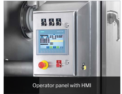
Operator panel with HMI