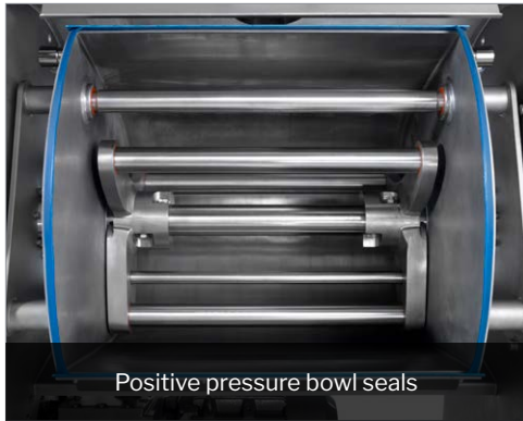
Positive pressure bowl seals