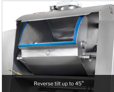
Reverse tilt up to 45°