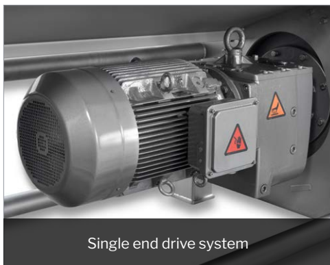
Single end drive system

**BFM® fitting is a registered trademark of BFM Global, Ltd.